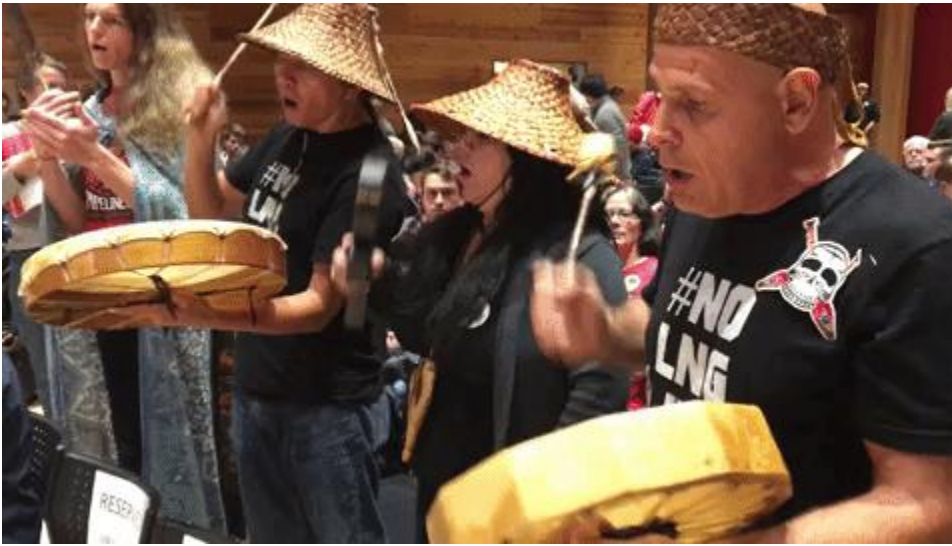
Fossil-fuel protesters sing before Gov. Jay Inslee's town hall on climate change